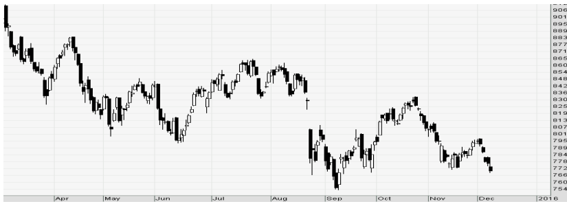
Increase in OI with Increase in Price (Long Buildup)

US: US closed more than 1.5 percent higher Wednesday for their largest three-day gain since late August, helped by some recovery in oil prices and encouraging economic data. Technically DJIA is presently trading at the 5th leg through Elliot wave count with negative divergence in oscillators.