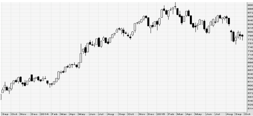
Increase in OI with Increase in Price (Long Buildup)

US: US market closed near session highs Tuesday, the first trading day of December, shaking off intraday pressure from weak manufacturing data. Technically DJIA is presently trading at the 5th leg through Elliot wave count with negative divergence in oscillators.